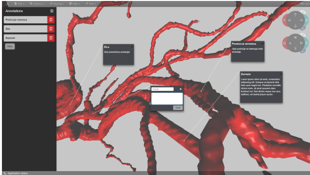
Figure 1: The Med3D framework with loaded 3D model of medical data. Figure also shows annotations pinned to the exact locations on the model.

Med3D also allows users to annotate the data they are viewing with 3D position based annotations and save the annotations for later review. We have also implemented a support for remote collaboration enabling specialists, mostly radiologists, getting second opinions from colleagues over the Internet or getting diagnosis from remote specialists at all. The data can be viewed locally by individual user it can be uploaded and shared with designated users of the framework, or it can be directly shared with an individual or group of users. The framework user interface is displayed in Fig. 1.