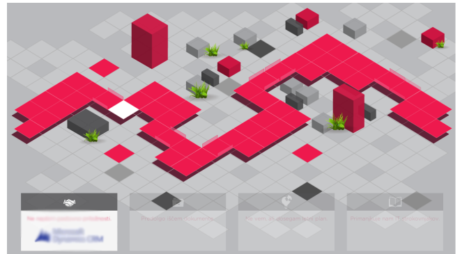
Figure 4: A screenshot of example application that uses our system.

We tested our implementation of touchless interface in a real life situation. An IT company from Slovenia wanted to present itself on an IT conference using touchless interface. The goal was to stand out and attract people passing by. We developed a simple browser based game that was controllable using our touchless interface. The application was developed for general use and can use conventional means of interactions as well (such as mouse and keyboard). The goal was to follow a given path with a mouse cursor from start to finish without touching the borders of the path. To avoid mistakes, all unnecessary gestures were turned off. The game was interesting to play when using our touchless interface because every user first had to learn how to guide the mouse cursor using only his hand and familiarize himself with the responsiveness and accuracy of our system. It turned out that some people had trouble replacing the mouse with a touchless interface while other mastered the game in seconds. It was very obvious that with a bit of training, usefulness and accuracy of our system was good. A screenshot of the application is presented in Figure 4.