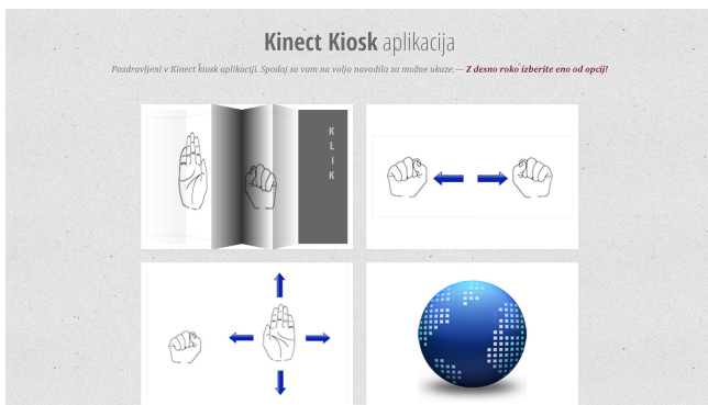
Figure 3: An example of welcome screen which can be used with our system.

After we implemented user tracking, we used this information to implement another function, automatic program starter. Every time a system detects a new user, it can automatically start any predefined program or open a new website. The idea behind this function is that every time a new user steps in front of a sensor, a so called “welcome” sequence can be started as shown in Figure 3. This way, a new user can be greeted and introduced to all of the functions our system enables him to use.